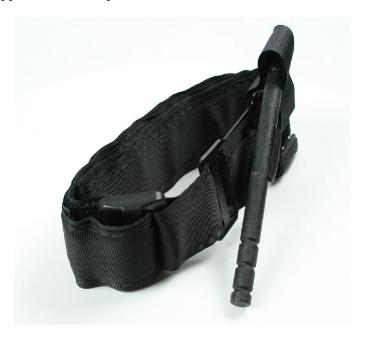
Figure 1: Combat Application Tourniquet